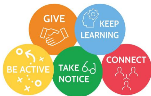
Figure 2: 5 Ways to Well-being (New Economic Foundation)

Active Travel is promoted in Ireland as part of the Climate Action Plan. It is defined in as "travelling with a purpose, using your own energy".