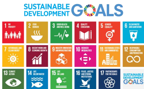
Figure 1: Sustainable Development Goals (United Nations)

The UN Sustainable Development Goals (SDG) agreed in 2015 and set the agenda for global development to 2030. Sustainable Development Goal 3: 'ensure healthy lives and promote well-being for all at all ages', with the target 3.4: To reduce mortality from non-communicable diseases and promote mental health.