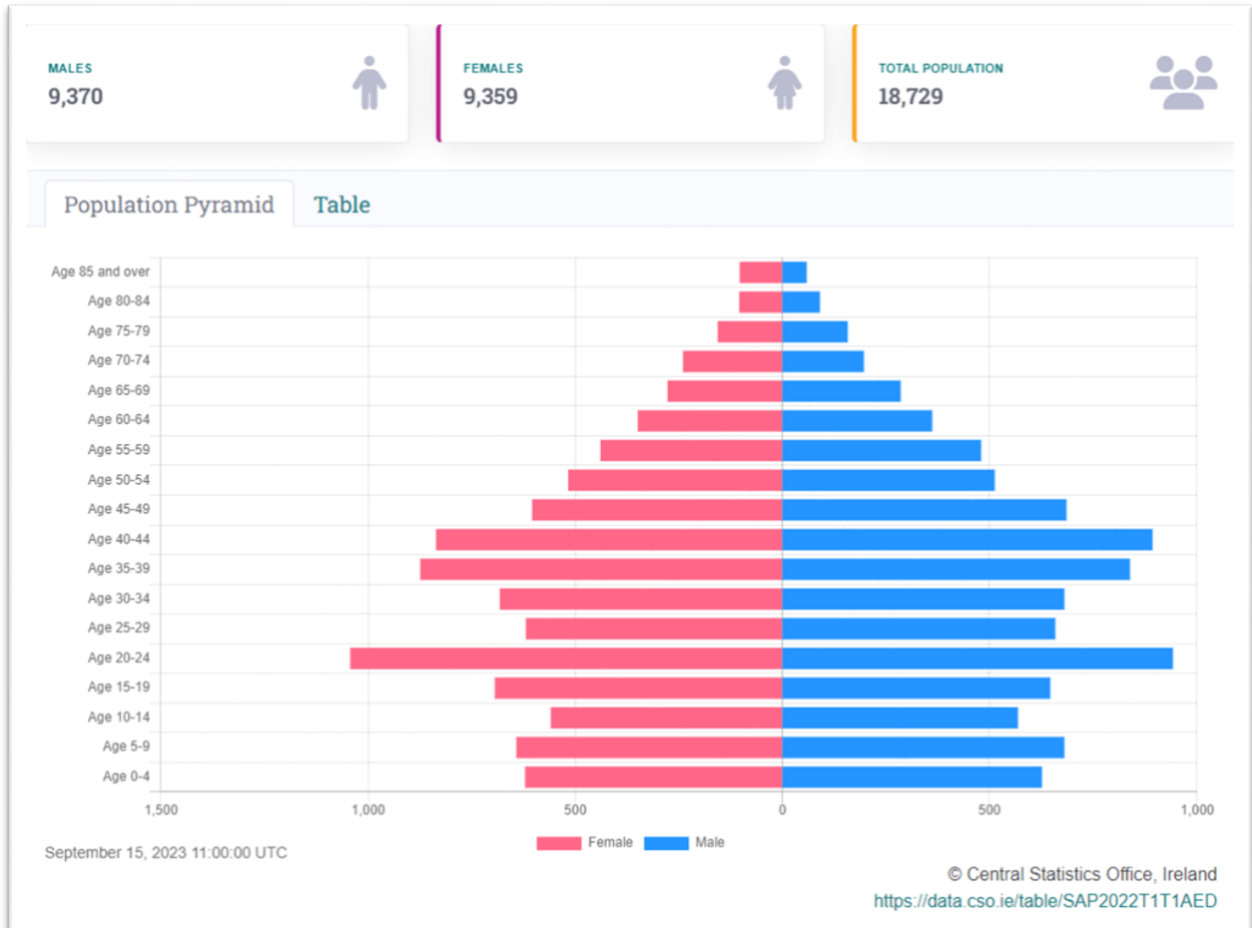
Diagram PSA-1 Population pyramid for Maynooth 2022

Activity PSA-1a Describe two features of the population living in Maynooth that you observe in the population pyramid in diagram PSA-1.