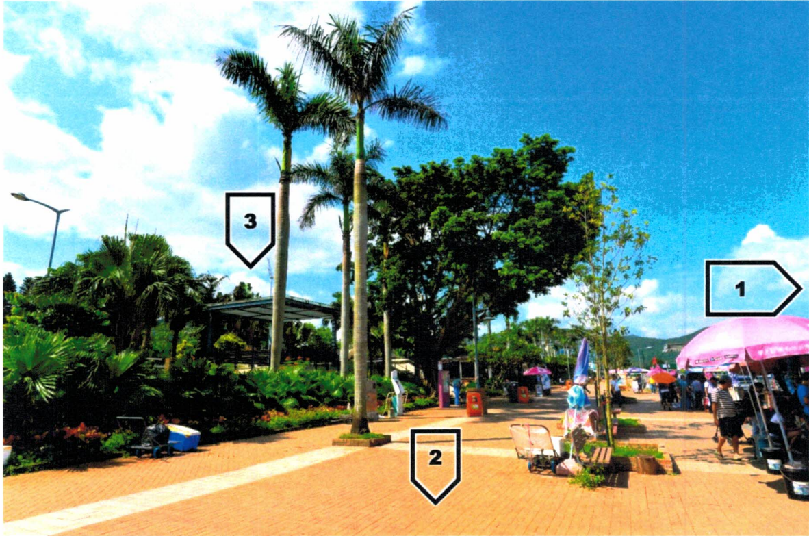
Figure B4: Fieldwork Station ST3. 1: Sai Kung Public Pier; 2: Promenade; 3: ST3 under the cyan metal pavilion with glass ceiling. Walk up stairs to get to it.