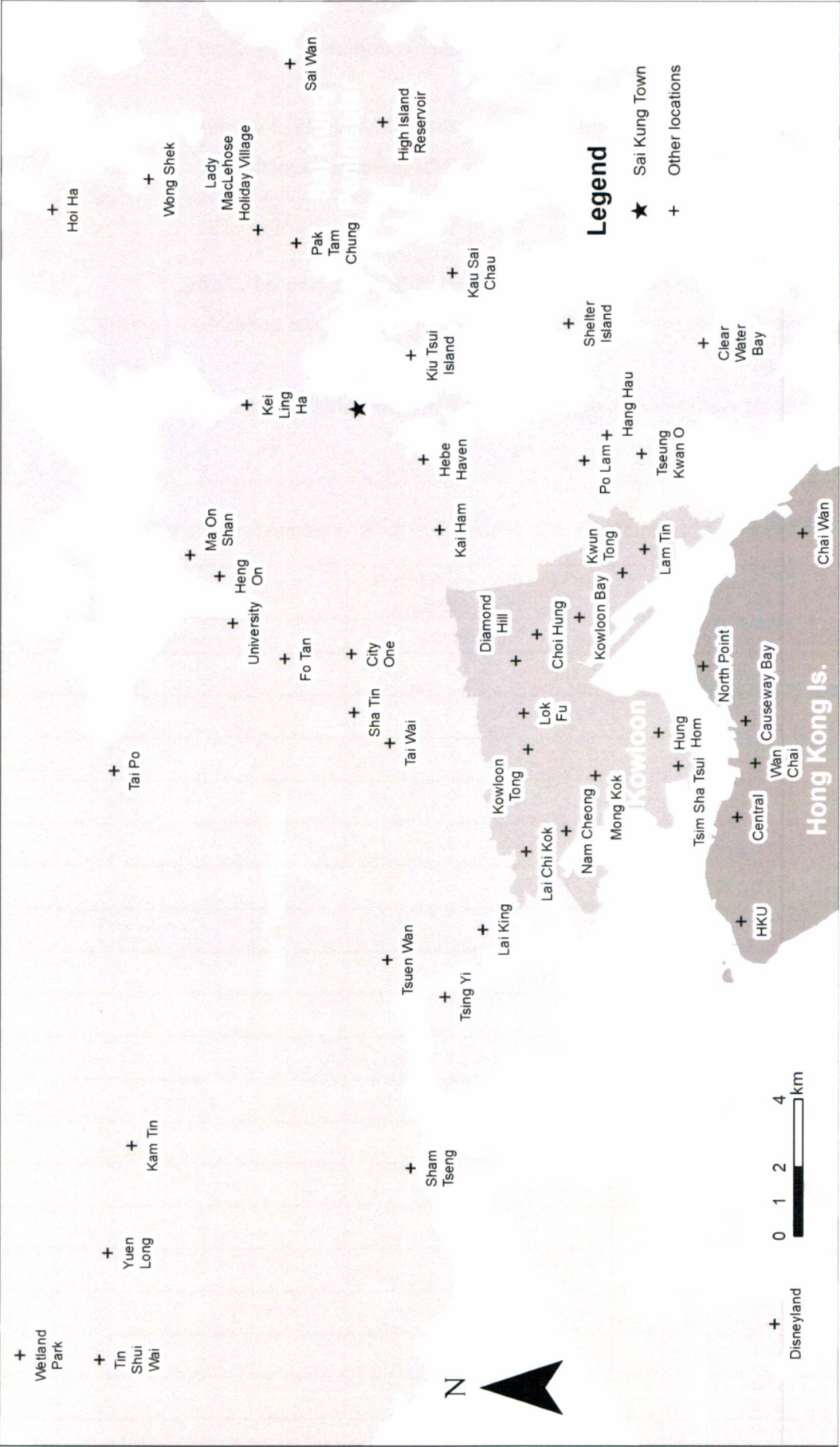
Figure B2: Transport End Terminals That Link to Sai Kung Town.