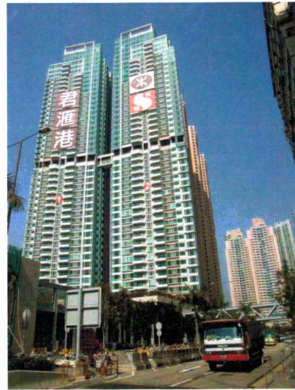
(f) Modern building 2 of the 2000s. 20-storey upwards but subject to local land use plan.