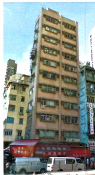
(d) Building of the 1970s having an utilitarian architecture 1 . Usually less than 20-storey.