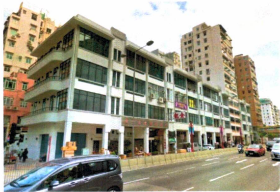
(b) Refurbished pre-war Chinese-style flat.