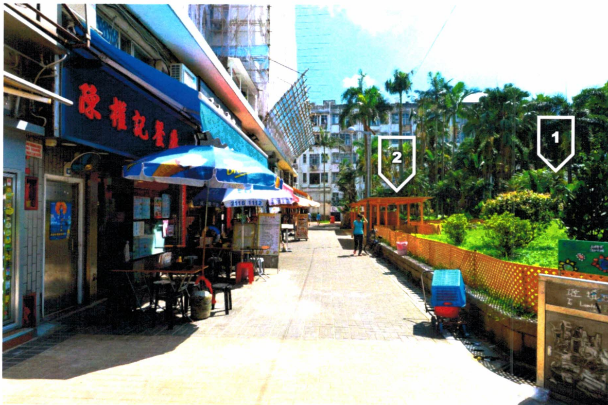
Figure A5: Fieldwork Station ST2. 1: Sha Tsui Playground; 2: ST2 under the orange pavilion.