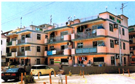
(c) Typical village house unit built after 1972. Floor area 700 feet 2 , 3-storey.