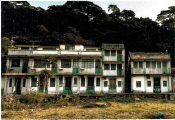
(a) Traditional village house units of the post-war period