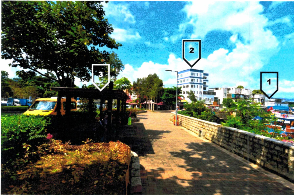
Figure A4: Fieldwork Station ST1. 1: Typhoon shelter; 2: Kat Cheung Building; 3: ST1.