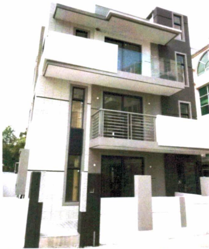
(e) Village house built in 2010s. Having a modern architecture. Floor area 700 feet 2 , 3-storey.